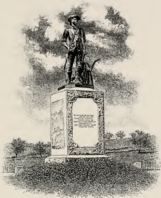
The Wm. H. Board & Co. Boston.